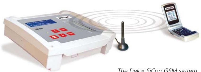
The Delox SiCon GSM system